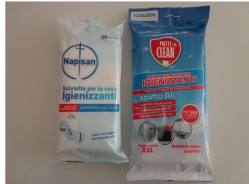
Competitors' products images