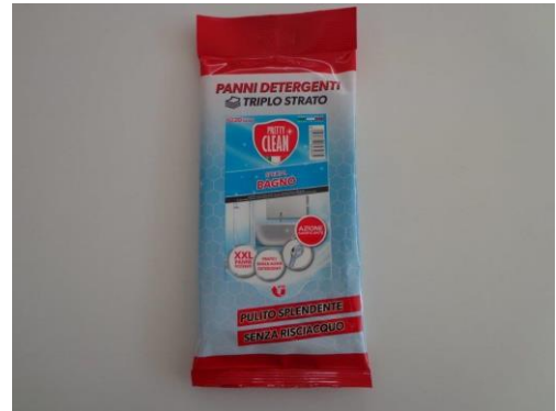
Competitors' products images