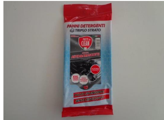
Competitors' products images