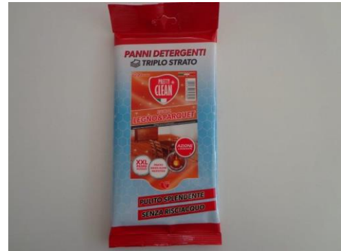
Competitors' products images