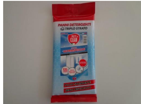
Competitors' products images