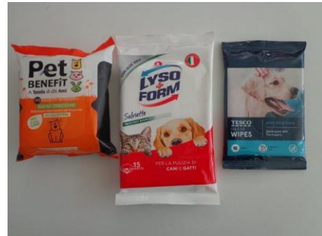
Competitors' products images