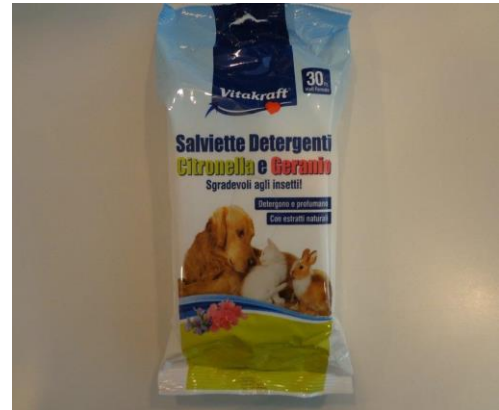
Competitors' products images