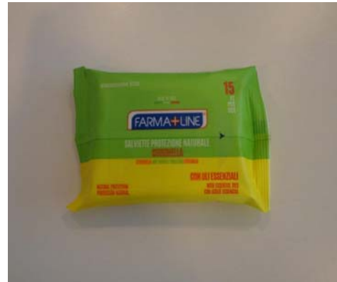
Competitors' product images